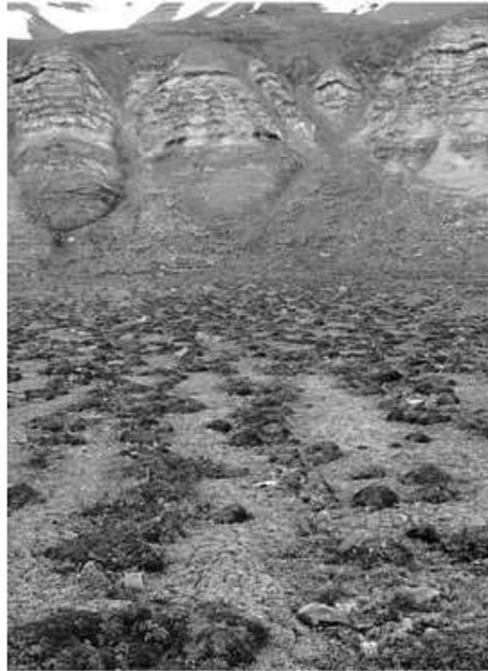
Prach, Klimešová, Košnar 2008